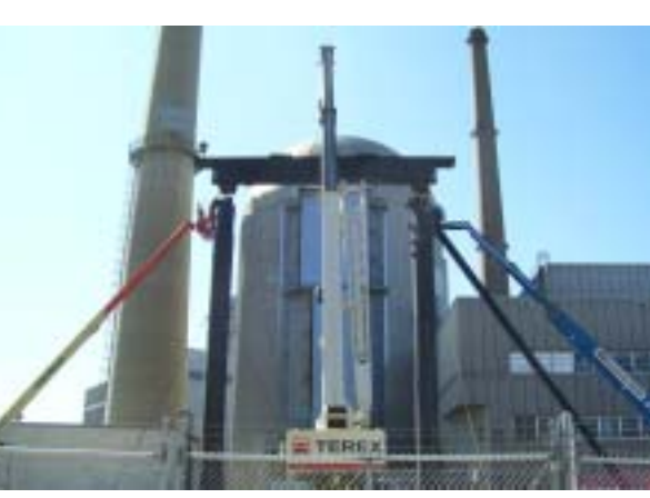
Removal equipment ready to work.

Security regulations require that Dairyland cannot specify an exact RPV shipment date. The removal and shipment of the RPV and other waste are planned and implemented in accordance with NRC rules and regulations. Two canisters of low-level, non-fuel waste from LACBWR have already been shipped and disposed of at Barnwell. Comple-